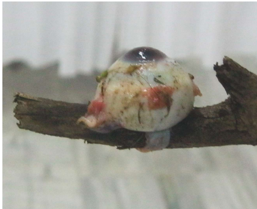
Eye as found on a tree branch after bear attack